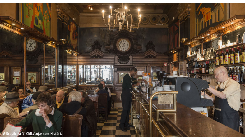
A Brasileira

CULTURAL HERITAGE IN ACTION Sharing solutions in European cities and regions